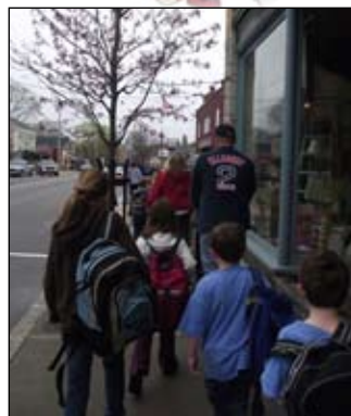
Parents & children walk down Main Street to Wakefield School